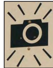
PHOTO RADAR RELIEF!

Don't forget it's family fun day with free pony rides and face painting for the kids!