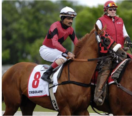
Theglow will be heading to Edmonton Monday for the Canadian Derby

The $300,000 Canadian Derby from Northlands Park will be Saturday, August 22. Winnipeg race fans can watch and wager on the biggest race in Western Canada at Assiniboia Downs that afternoon.